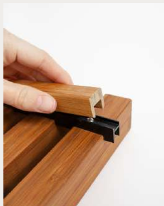
Hiding aluminum strip with Seachange Cover.