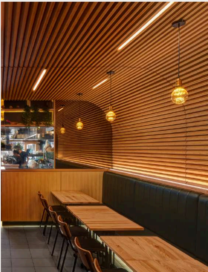
SeaChange Cottesloe Horizontally.