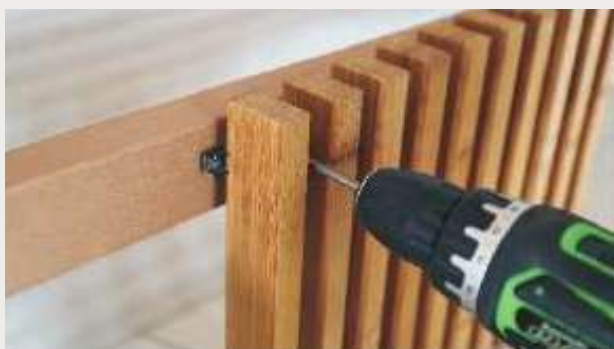
Installing a Screen to the frame structure.