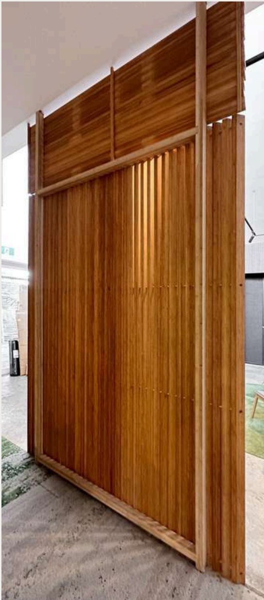
Self-standing Silhouette screen (for reference purposes only)