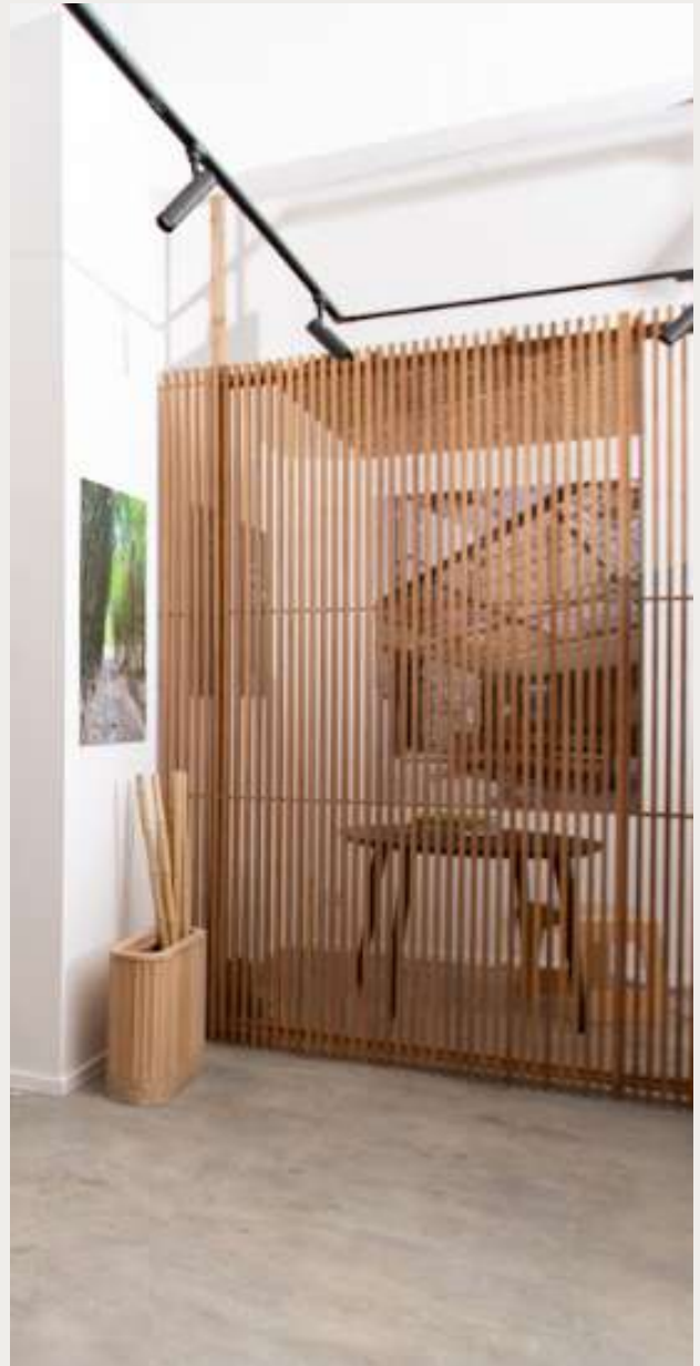
Self-standing Silhouette screen (for reference purposes only)