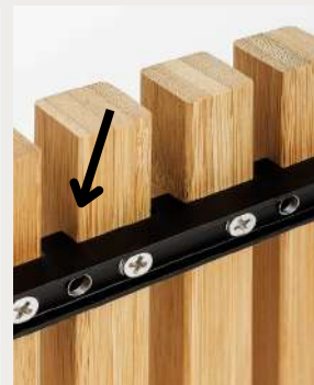
This images show the pre-drilled holes.