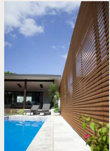
Aluminium strips screwed into the posts