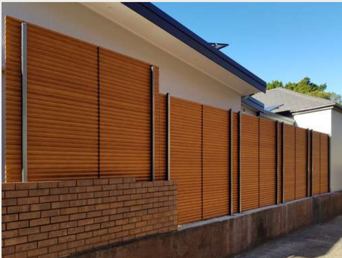
SeaChange Screen Fence with 5 modules.